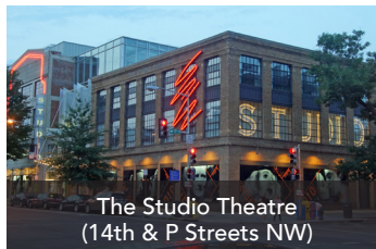
The Studio Theatre (14th & P Streets NW)