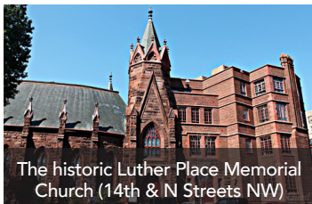
The historic Luther Place Memorial Church (14th & N Streets NW)